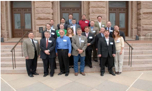
(For more pictures, scroll to bottom of article and click to enlarge.)

I keep telling myself that one day things are going to slow down enough around here for me to catch up on the things that are piling up in my “in-box.” Included in this stack of minutiae are all the articles and reports that I receive on a weekly basis that I deem important enough to get back to at a later date, but not important enough to do any more than scan as they arrive at my desk.