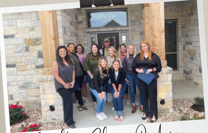
Builders Choice Judging Lunch sponsored by Monteith Abstract & Title