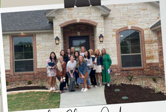
Peoples Choice Judging Lunch sponsored by CentraLand Title Company