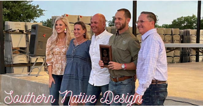
Southern Native Design